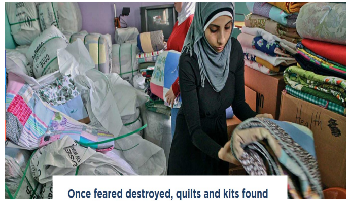
Once feared destroyed, quilts and kits found near site of Beirut blast

A few months ago it was reported that three containers with more than $600,000 worth of Lutheran World Relief quilts and kits had been destroyed in the explosion in Beirut, Lebanon, on August 4.