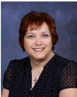
LWML Mid-South District Mission Grant Recipients for 2020-2022